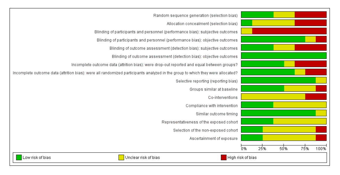
Figure 3. Risk of bias graph: review authors' judgements about each risk of bias item presented as percentages across all included studies.