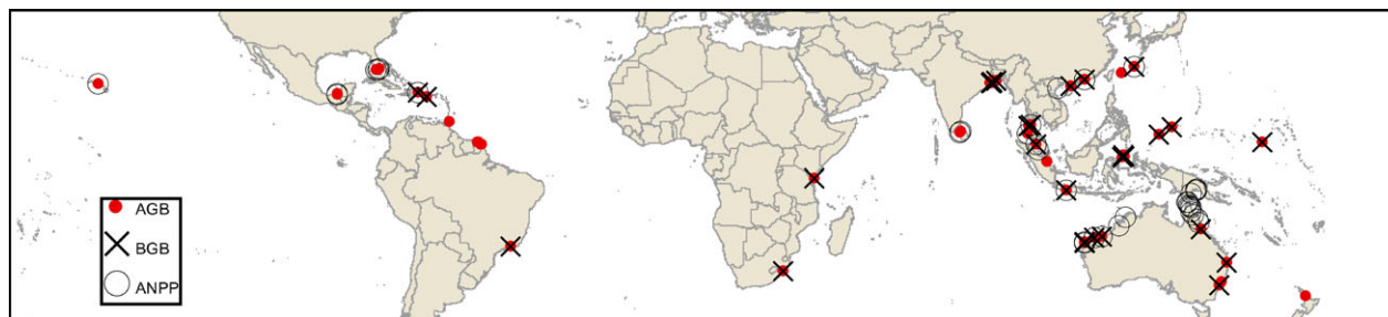
Figure 1 Global map of mangroves showing the locations where data were obtained for one or more measures of carbon stocks and fluxes.

(Table 3). Table 4 shows national statistics for the 10 countries with the largest mangrove AGB.