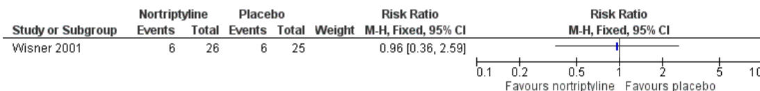
Figure 4. Forest plot of comparison: 1 Nortriptyline versus placebo, outcome: 1.1 Recurrence of postpartum major depressive disorder.