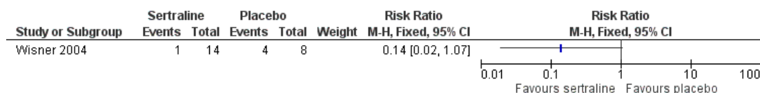
Figure 5. Forest plot of comparison: 2 Sertraline versus placebo, outcome: 2.1 Recurrence of postpartum major depressive disorder.

postnatal depression) for those not included in the original analyses, we calculated the RR to be 0.47 (95% CI 0.16 to 1.42, P = 0.18 ). Assuming a positive outcome for these three participants (i.e. no onset of postnatal depression), we calculated the RR to be 0.12 (95% CI 0.02 to 0.89, P = 0.038 ). Wisner 2004 also reported that the time to recurrence differed between the sertraline and placebo groups (exact Gehan-Wilcoxon P = 0.02 ). The observed hazard ratio for time to recurrence of depression was 0.11 (95% exact CI = 0.02 to 1.02).