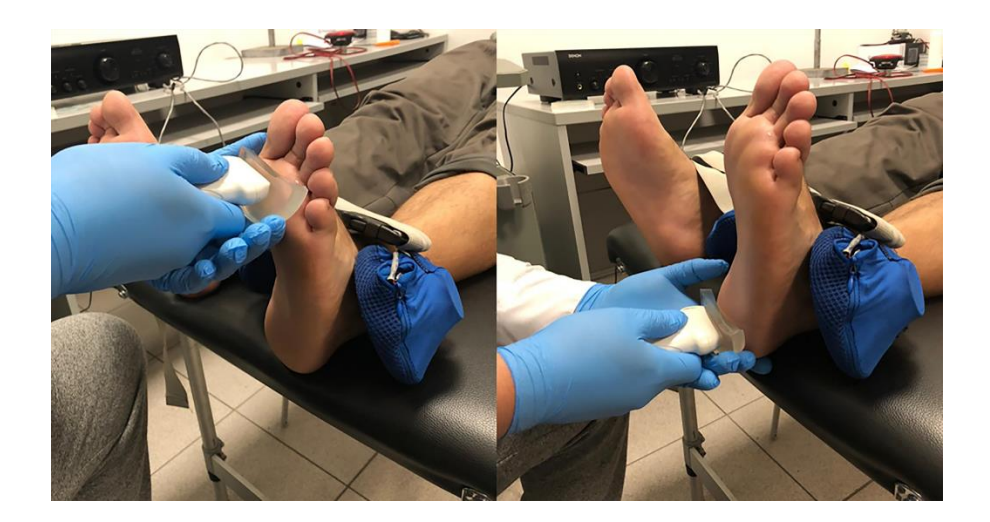
Figure 1. The data collection setup and the positioning of the speakers adjacent to the foot. The probe is shown to be in contact with the plantar skin at the heel through the stand-ff material.