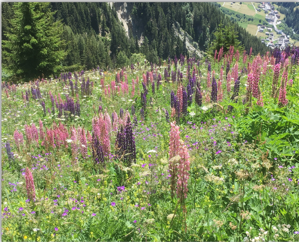
Wildflower mountain meadow

The autoethnographic method in my Meadow patches followed the pathway student counsellors tread with the Patchwork of Practice exercise. I created patches, however there wasn't opportunity to share these with others as student counsellors would do. So I noted and explored my reflections on each patch and any associated reflexive writing; this is exploration from outside a patch and writing. I also reflected on my experience during the process of creating the patch; reflection from within creating of a patch.