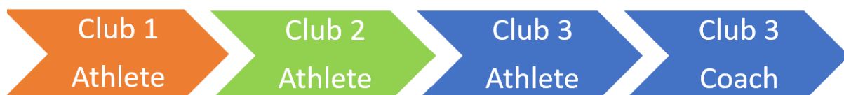
FIGURE 2. CATEGORIES FOR DESTINATION OF FIRST FORMALISED COACHING ROLE