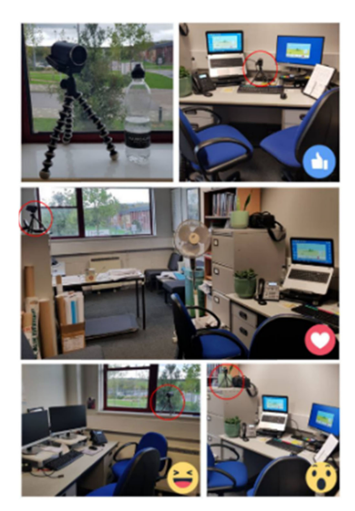
FIGURE 4 Facebook group post requesting opinions about camera position.

FIGURE 3 Facebook group post requesting feedback from patient and public involvement and engagement group members.