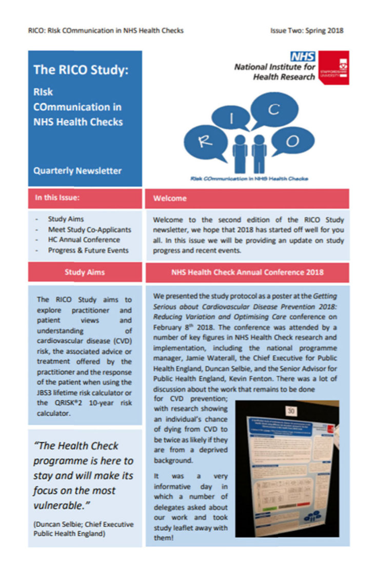
FIGURE 2 RIsk COmmunication in NHS Health Check (RICO) newsletter.

Members of the PPIE group were consulted about the most appropriate place to put the camera in the consultation room for the video-recorded NHSHCs (Figures 4 and 5). Two Facebook posts created by a member of the research team provided images of possible positions in the consultation room where a camera could be placed to record the NHSHC for the study, alongside a picture of the camera itself with a bottle of water for size comparison. Members of the group were asked to indicate their preferred camera position using the like, love, laugh or wow reaction icons on Facebook.