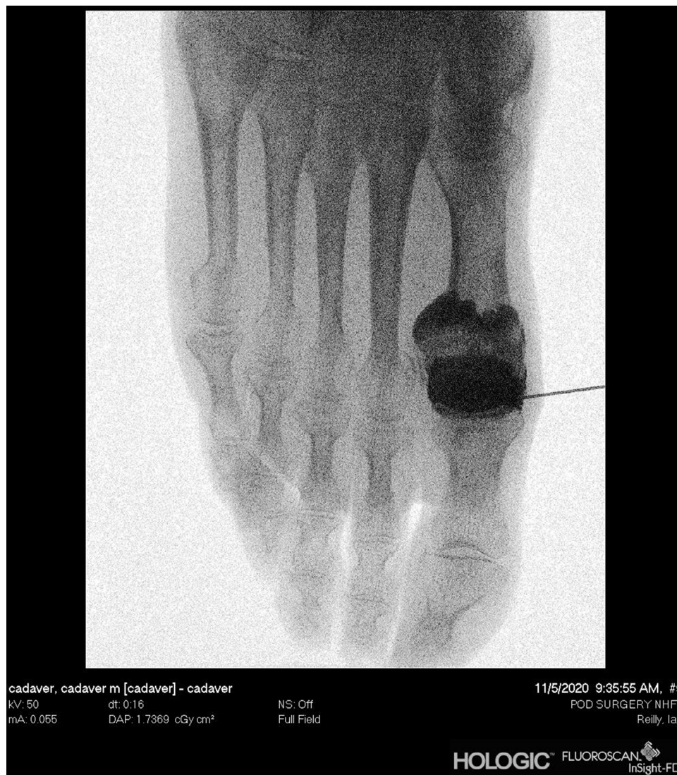
Fig. 2. Needle placement in the 1st MTP jt (specimen 1) post infiltration.