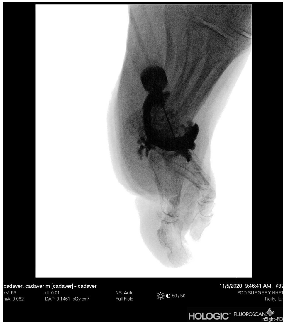
Fig. 4. Extra-articular leakage of injectate (specimen 5).

anatomy (and joint mobility) is more difficult to identify in stiff, embalmed specimens.