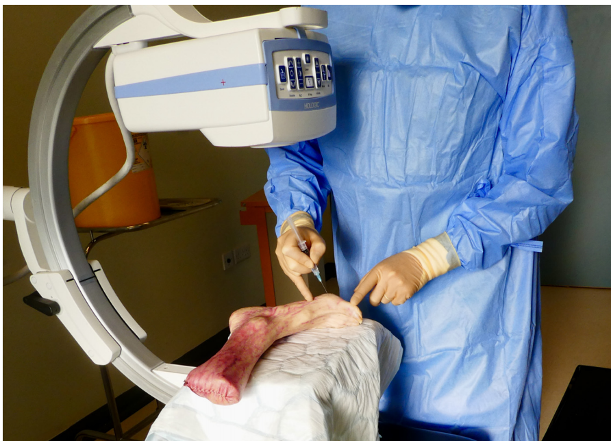
Fig. 1. Needle placement in the 1st MTP jt prior to X-ray.