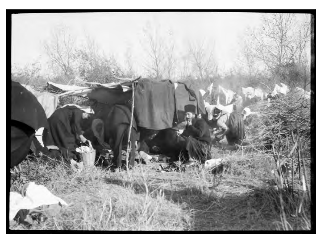
FIGURE 2.11 Orthodox Pilgrims' camp, River Jordan, 1921–1923