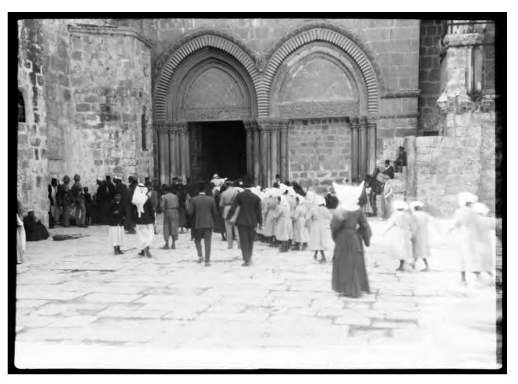
FIGURE 2.3 Holy Sepulchre, Jerusalem, 1921–1923