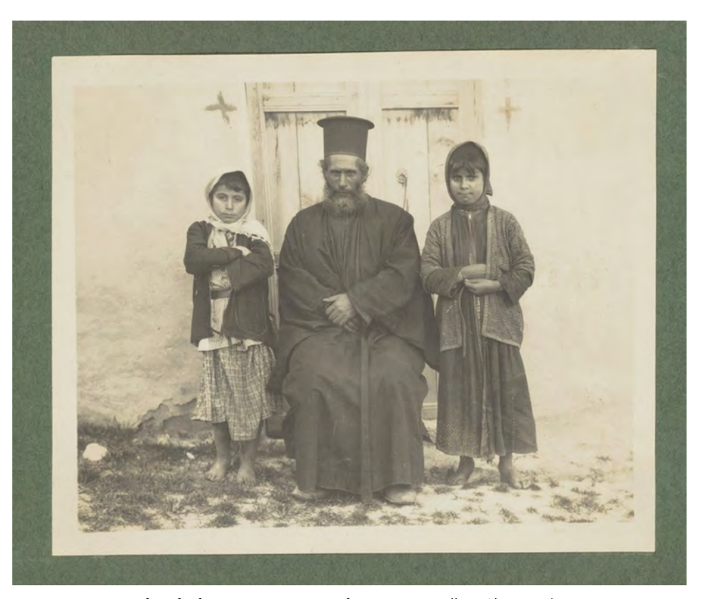
FIGURE 2.13 Greek Orthodox Priest in Anjara, Jordan, 1921–1923, Album Choses Intéressantes 1 UBL_NINO_F_Scholten_Palestine_Choses_Interessantes_01_024