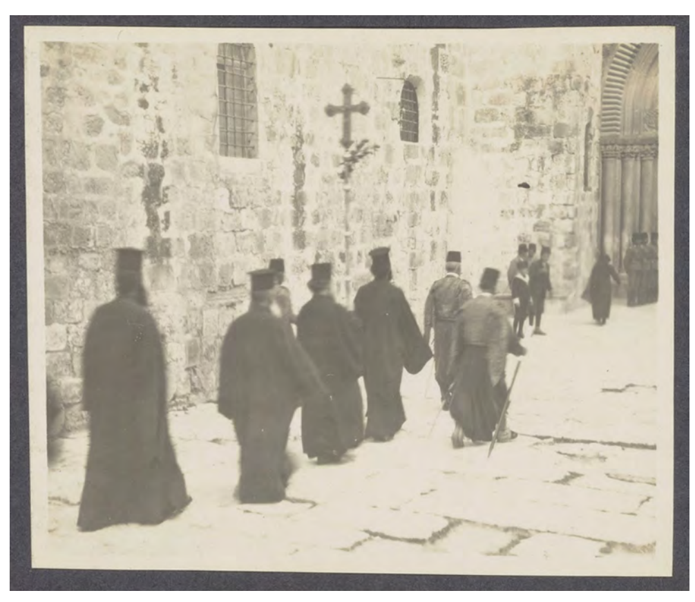
FIGURE 2.4 Greek Orthodox Priests at the entrance of the Holy Sepulchre on the Holy Thursday, Album Choses Intéressantes 3, 1921–1923 UBL_NINO_F_Scholten_Palestine_Choses_Interessantes_03_012 NINO, NETHERLANDS INSTITUTE FOR THE NEAR EAST, LEIDEN UNIVERSITY