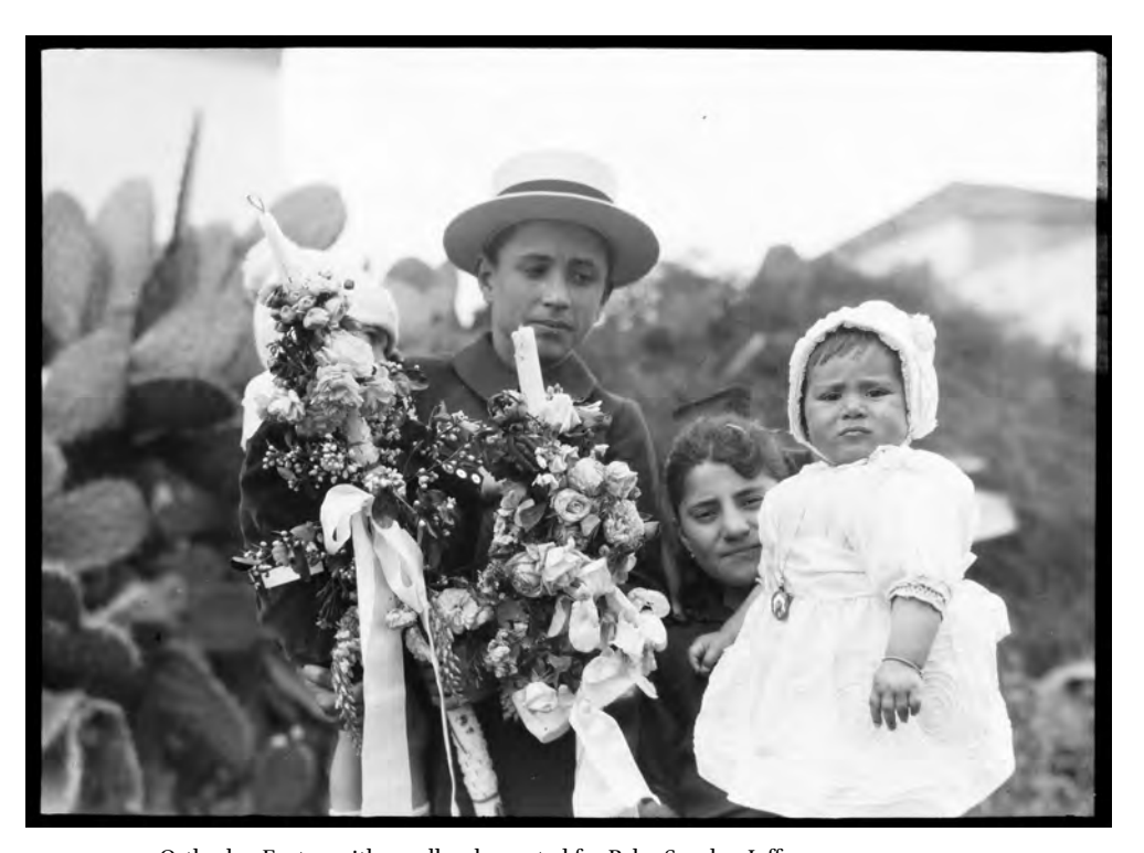
FIGURE 2.7 Orthodox Easter, with candles decorated for Palm Sunday, Jaffa, 1921–1923