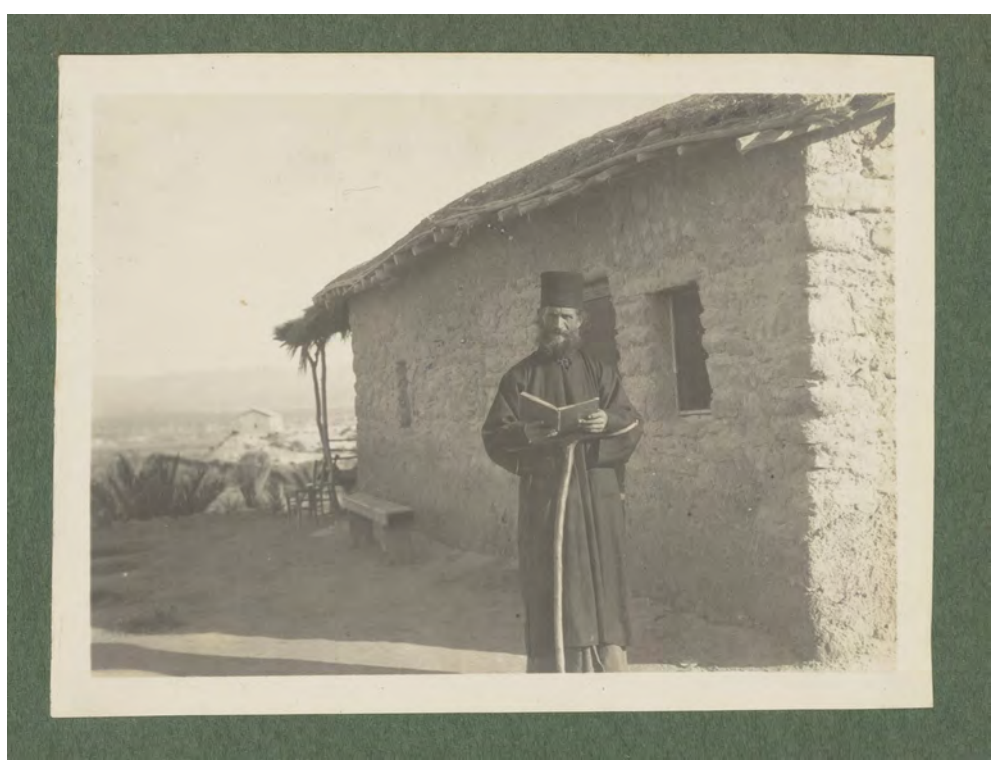
FIGURE 2.14 A Greek Orthodox Hermit and His House, Beit Hogla (East of Jericho) 1921–1923, Album Choses Intéressantes 1