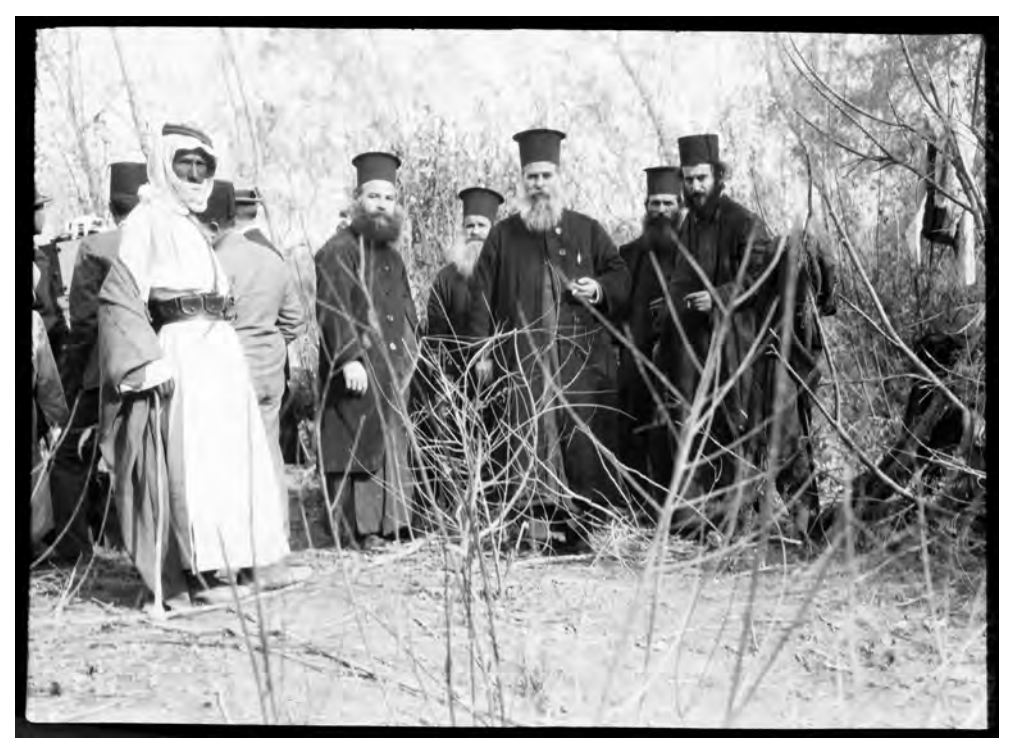
FIGURE 2.10 Tour guides, dragomans and Greek Orthodox priests, Jordan River, 1921–1923