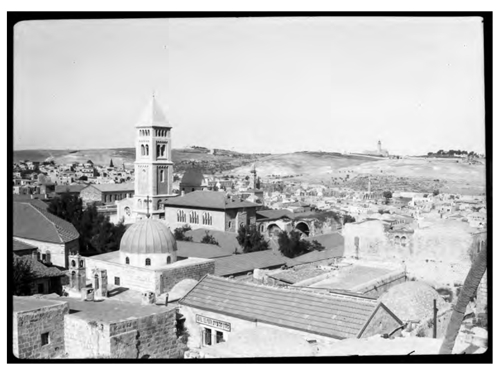
FIGURE 2.2 Old City of Jerusalem, 1921–1923 UBL_NINO_F_Scholten_Jerusalem-chretiens_02_001 NINO, NETHERLANDS INSTITUTE FOR THE NEAR EAST, LEIDEN UNIVERSITY