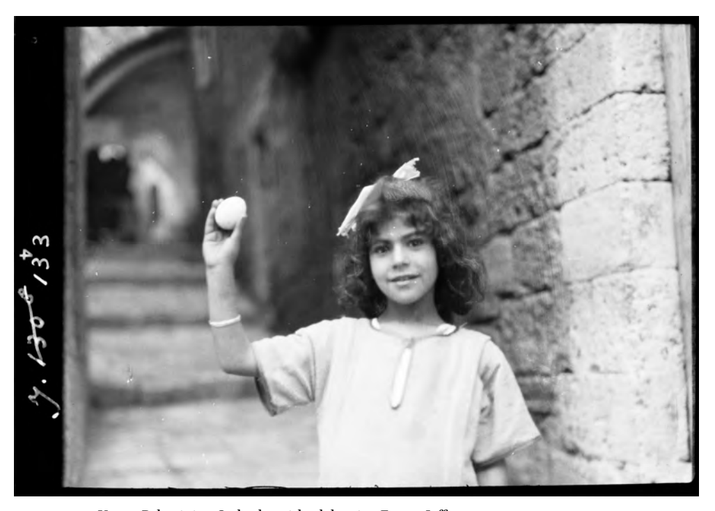
FIGURE 2.8 Young Palestinian Orthodox girl celebrating Easter, Jaffa 1921–1923 UBL_NINO_F_Scholten_Porte_Entree_101–150_0008