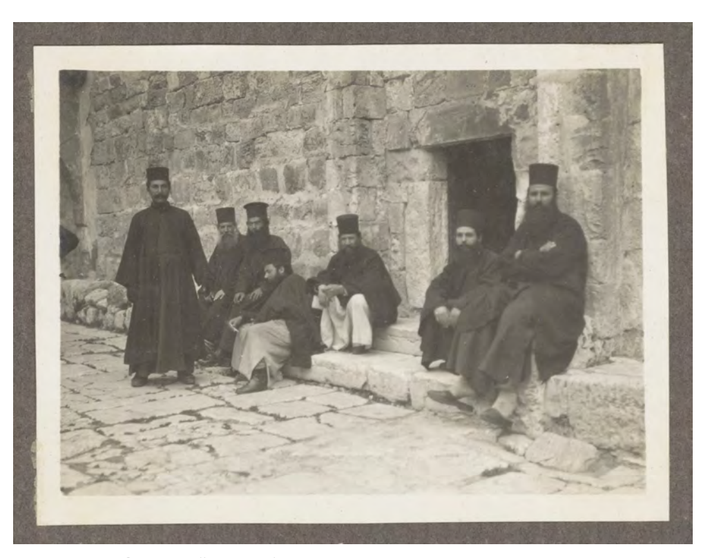
FIGURE 2.5 Greek priests, Album Jerusalem 1, 1921–1923