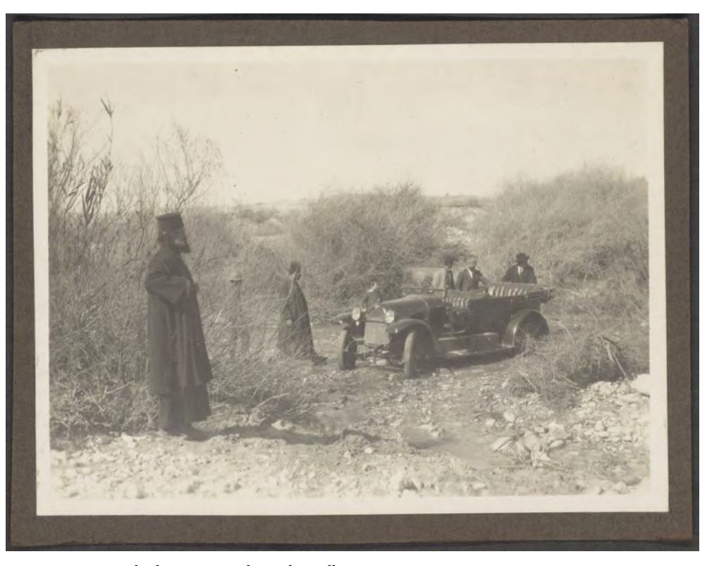
FIGURE 2.12 Orthodox Priests in the Jordan Valley, 1921–1923