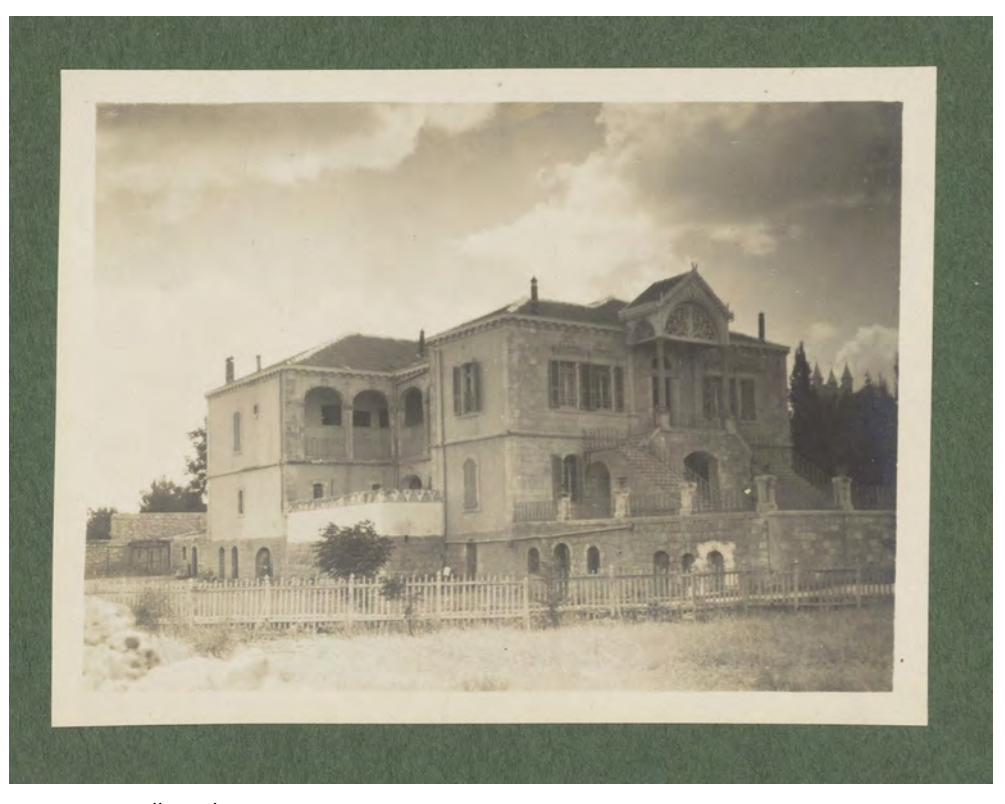
FIGURE 2.6 Villa Arabe, 1921–1923 UBL_NINO_F_Scholten_Palestine_Jerusalem_08_031 NINO, NETHERLANDS INSTITUTE FOR THE NEAR EAST, LEIDEN UNIVERSITY