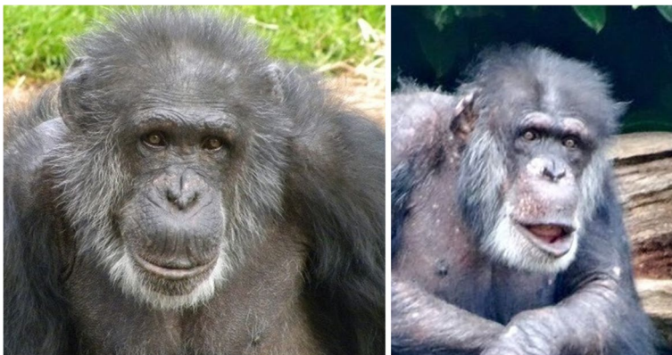
Fig. 3 Examples of Relaxed Face (left) and Relaxed Face with drooped lip (coded and henceforth referred to as Relaxed Open Mouth ) (right) in adult males, Boris and Friday, at Chester Zoo

to personality in chimpanzees based on facial morphology. We also tested expected correlations between items on the TIPI and CHMP-Tri scores at T2 (P2).