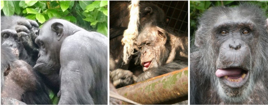
Fig. 2 Illustration of the Grooming Face in adult female, Alice (left) and Relaxed Open Mouth Tongue Out in adults Sally (centre) and Boris (right), at Chester Zoo