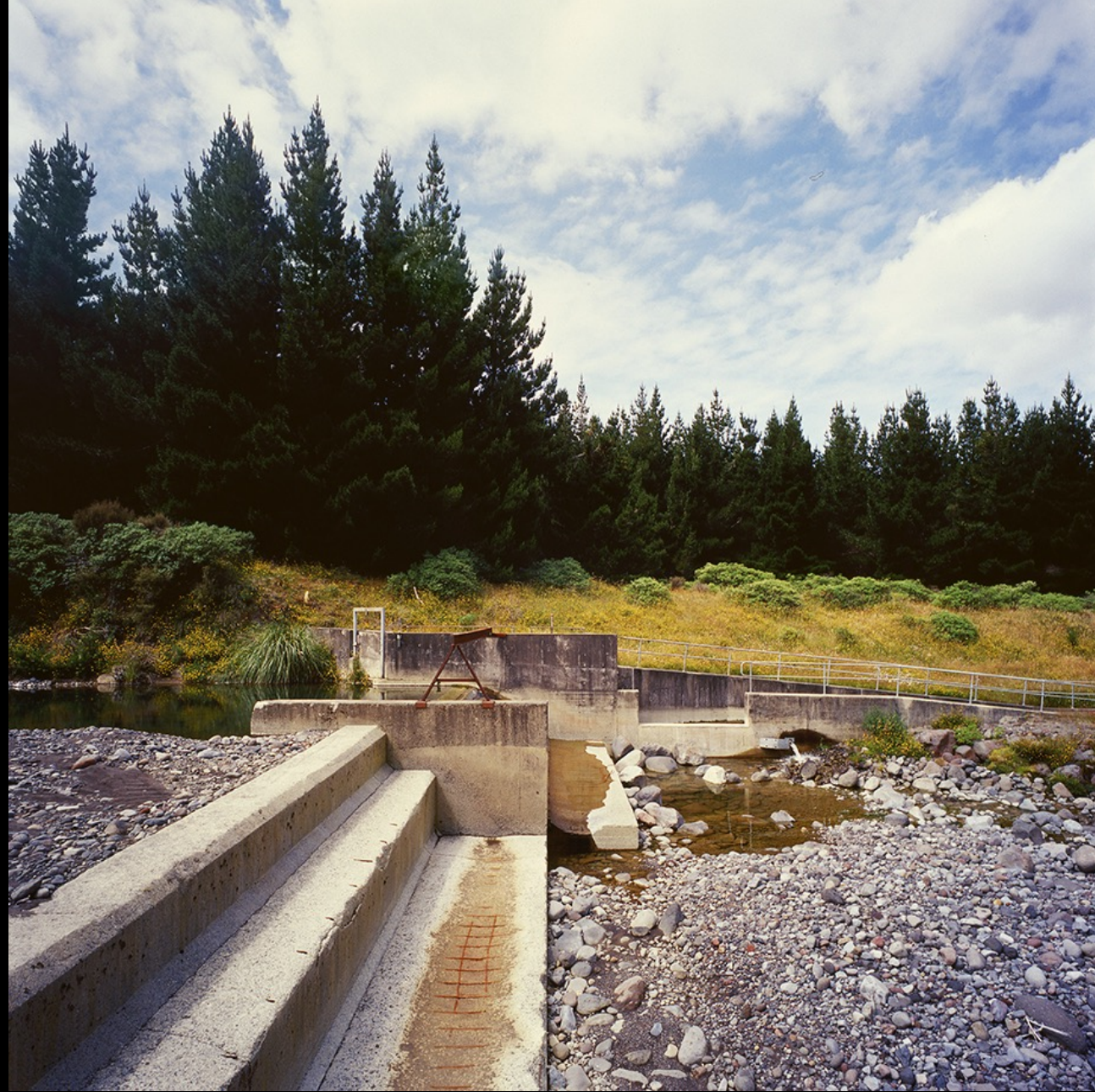
Intake. 2013 B Nunes Analogue 6x6 E6 original