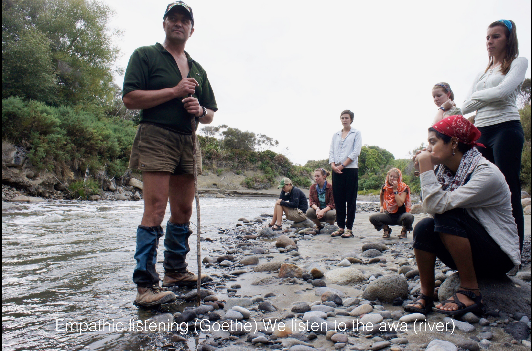
Empathic listening (Goethe). We listen to the awa (river)