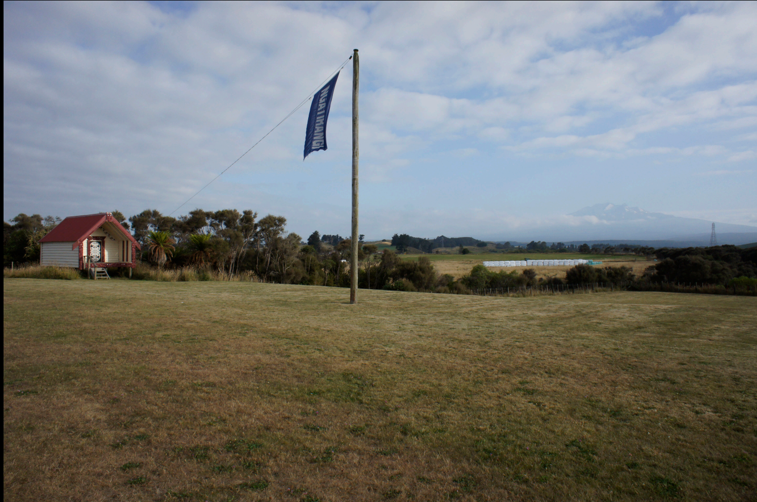
Tirorangi Marae, Ngati Rangi tribal lands