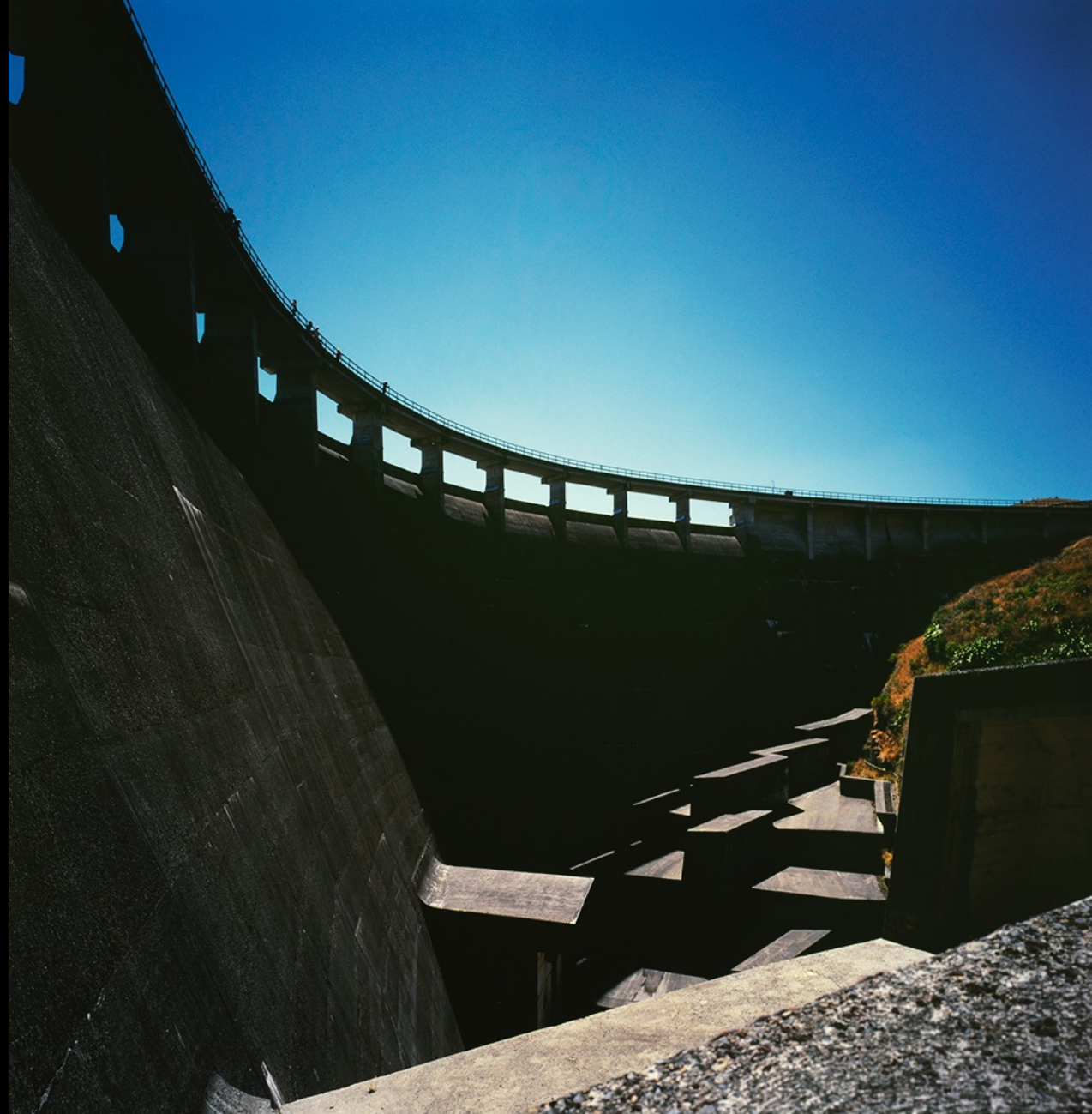
Moawhango Dam. 2013 B Nunes Analogue 6x6 E6 original