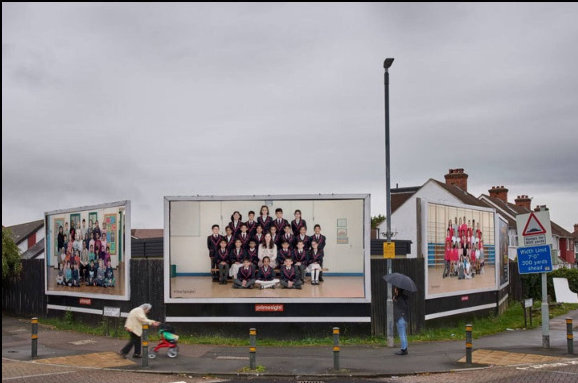
Steve McQueen. Year 3.