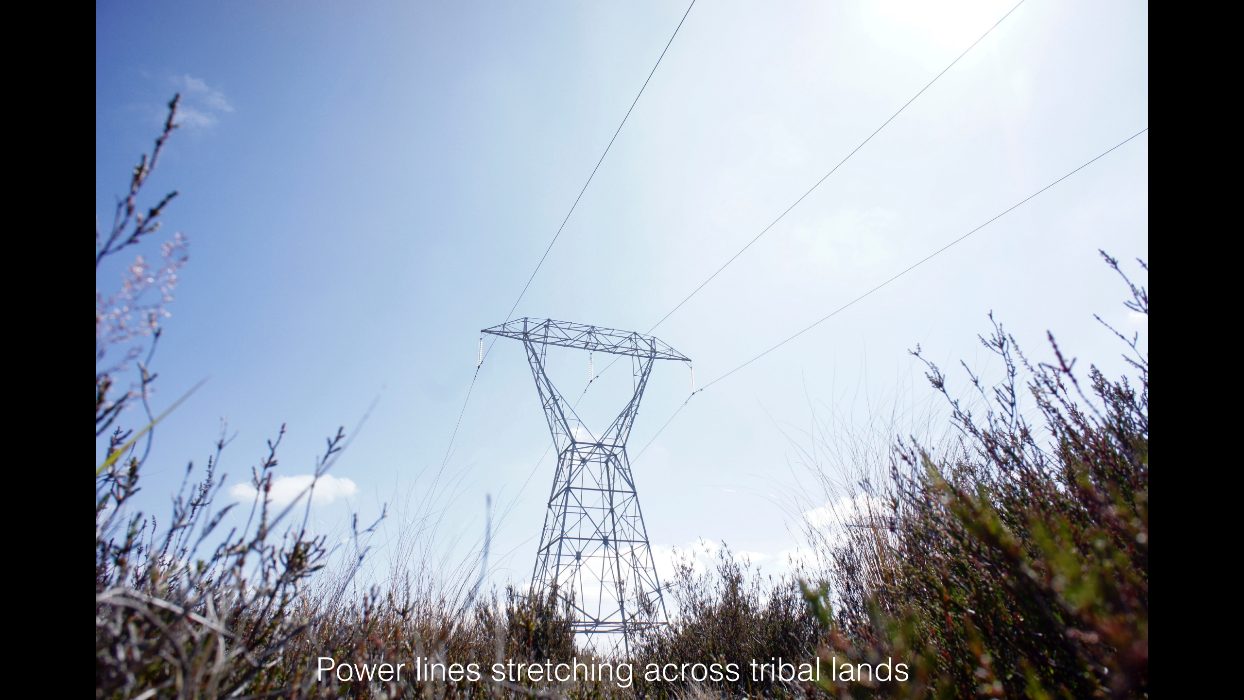
Power lines stretching across tribal lands