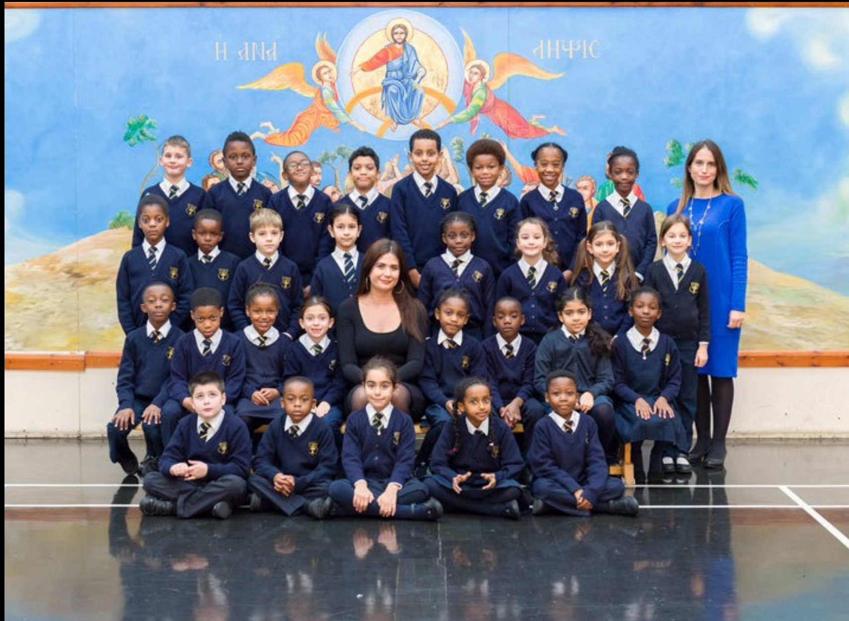
Steve McQueen. Year 3.