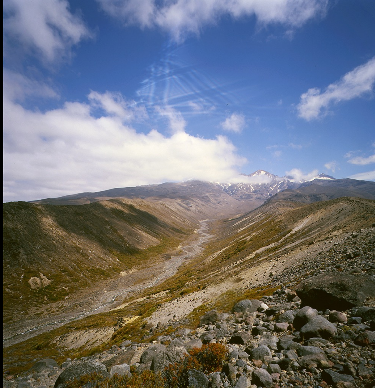
Koro Ruapehu with sky sign 2013. B Nunes Analogue 6x6 E6 original