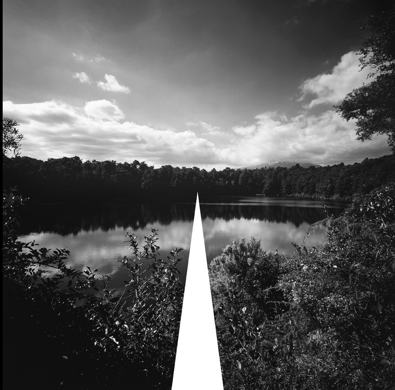
GPSMap650C. 2013 B Nunes Analogue 6x6 E6 original,1000x1000 C Type print