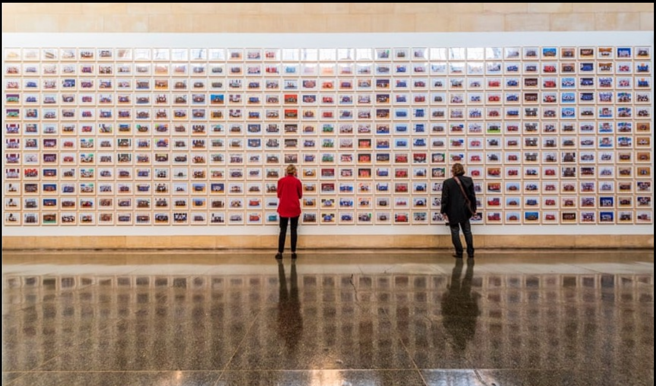
Steve McQueen. Year 3.