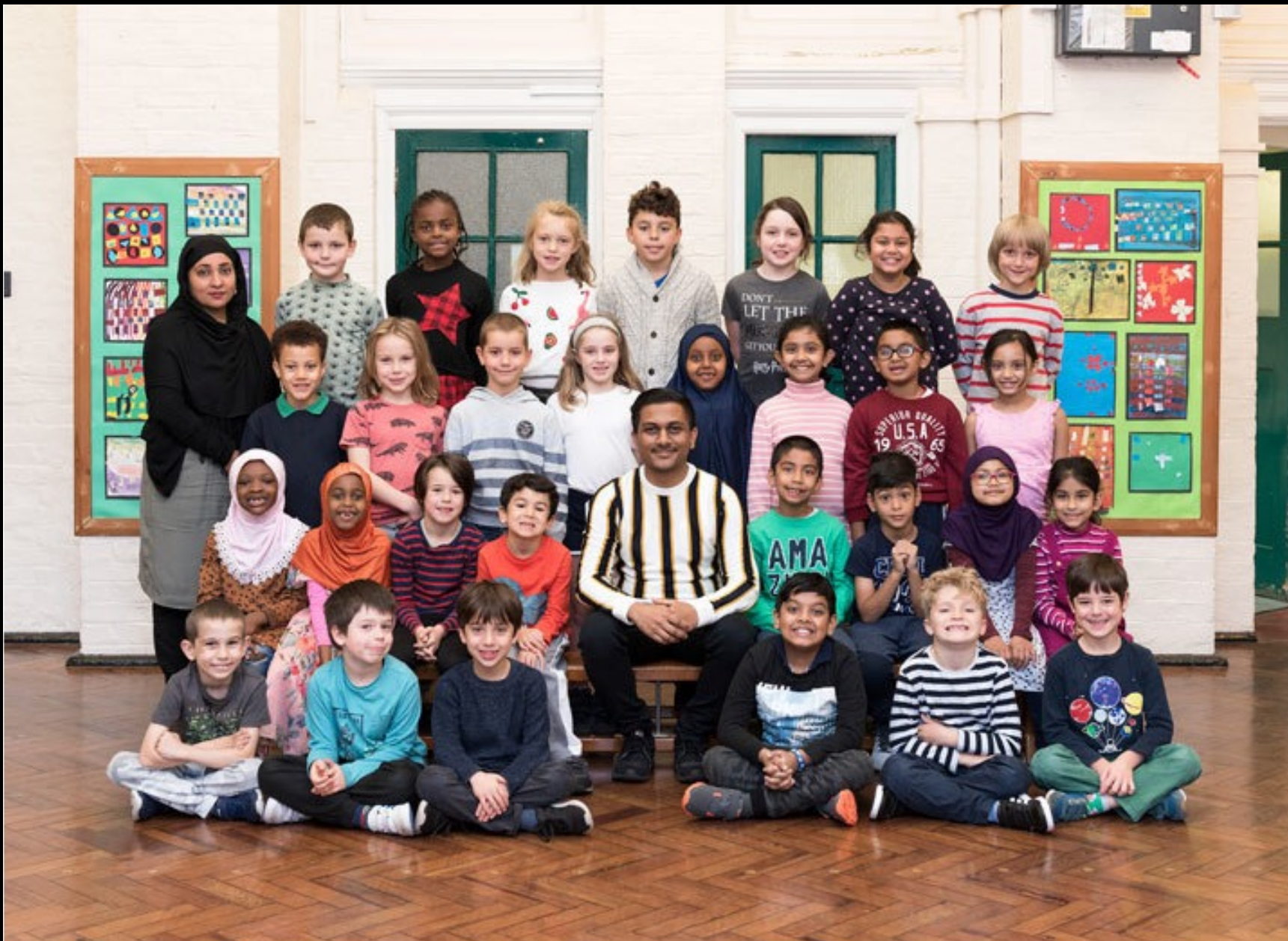
Steve McQueen. Year 3.