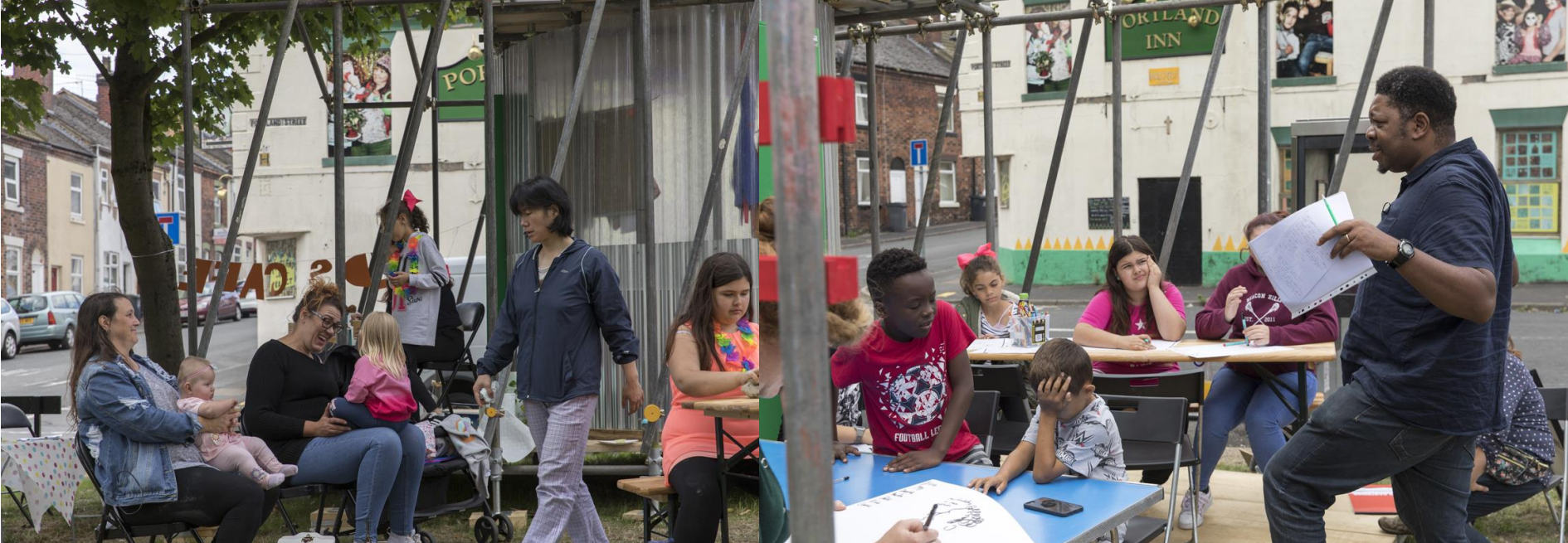
Raising The Roof, 2018: Asset Transfer Agreed and a process to continue to build confidence in the Community around what we can achieve together – Community Co-Build tested