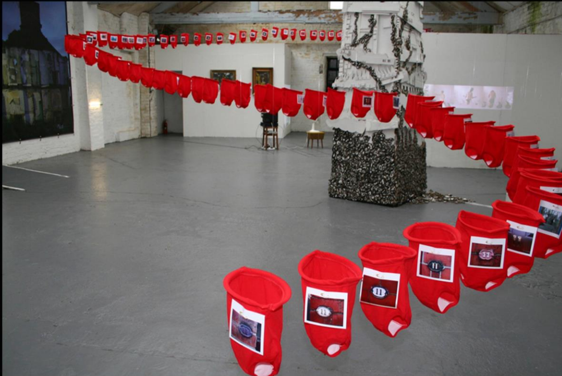
Indefinable City Exhibition at AirSpace Gallery, 2007 (My role artist led Curator)