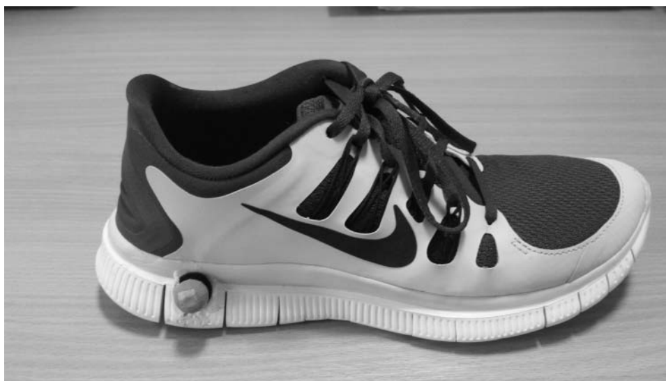
Figure 1. Experimental footwear fitted with 10-mm marker.

10-mm marker was positioned on the top of the shoe midsole at the rear of the shoe (Figure 1).