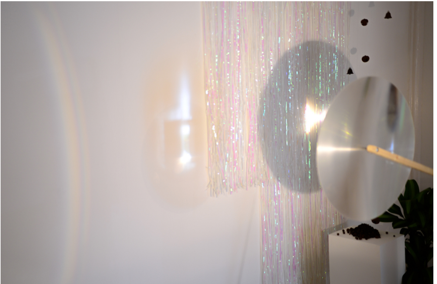
Battle Lines , Leslie Deere