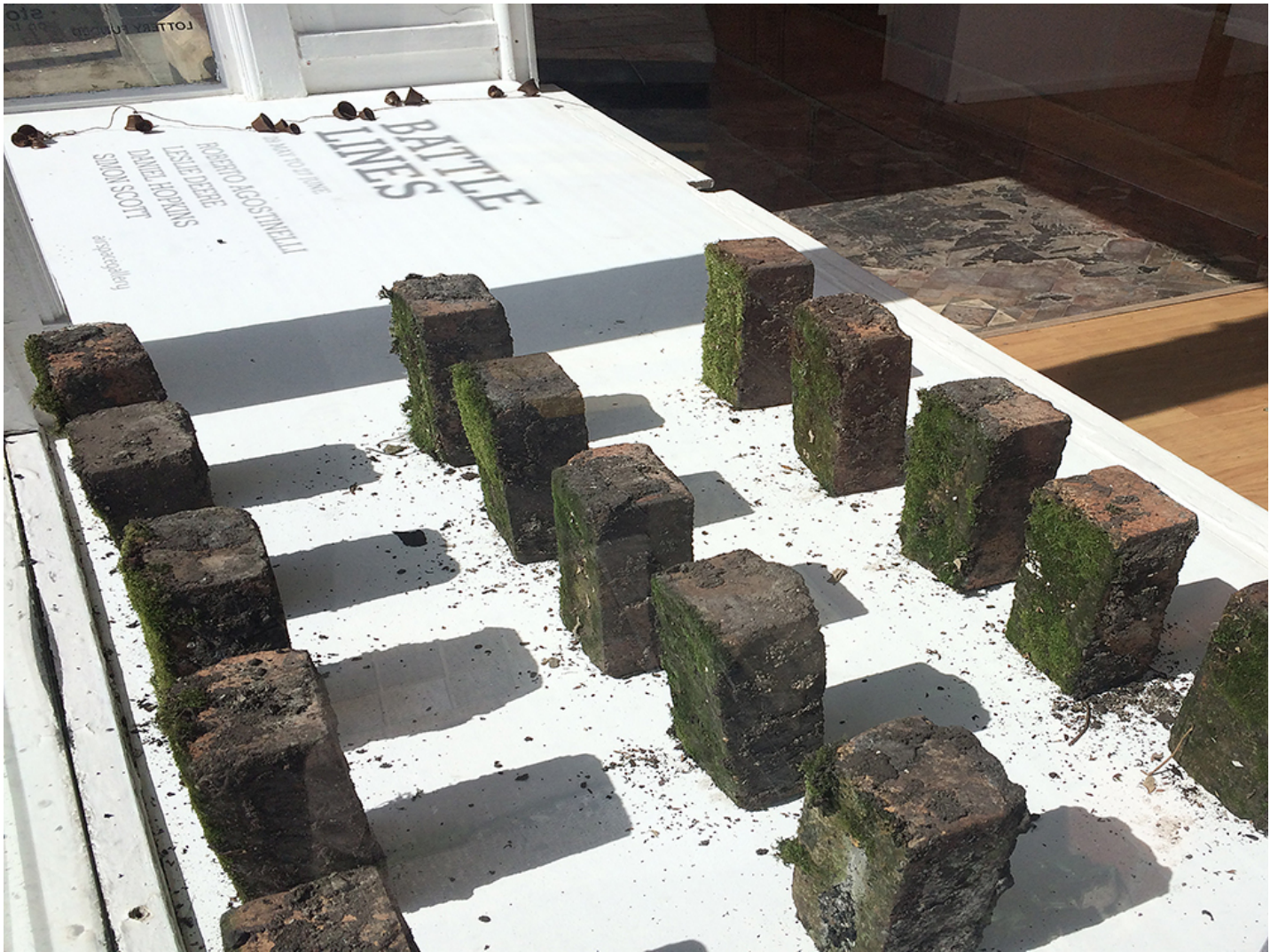
Battle Lines, Window installation view