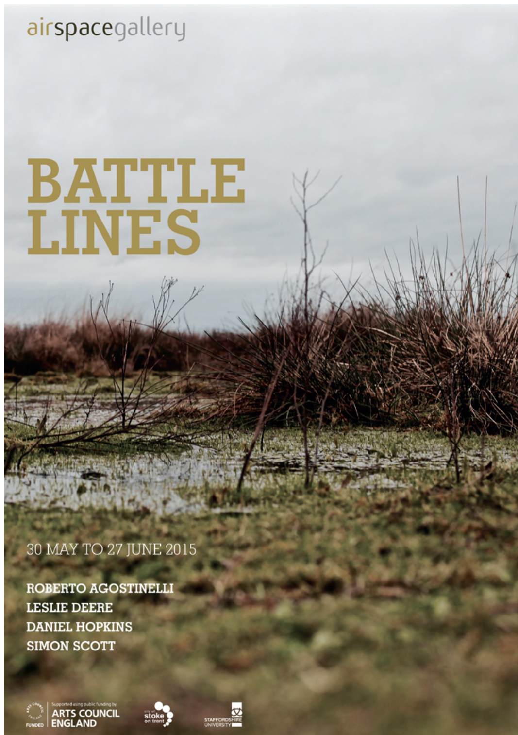
Battle Lines, Poster