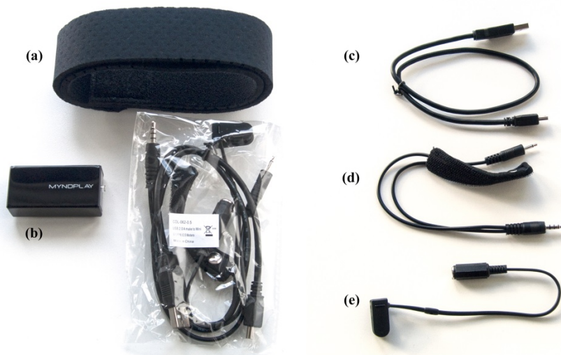
Fig. 2. The components of the MyndPlay BrainBandXL EEG Headset: (a) the headband on which the rest of the components are attached, (b) the unit that transmits via Bluetooth the EEG data to the computer, (c) the USB cable for charging the unit, (d) the two dry sensors attached to a soft material similar to the one used for the headband, and (e) the ear clip with the grounding electrode for the ear lobe.