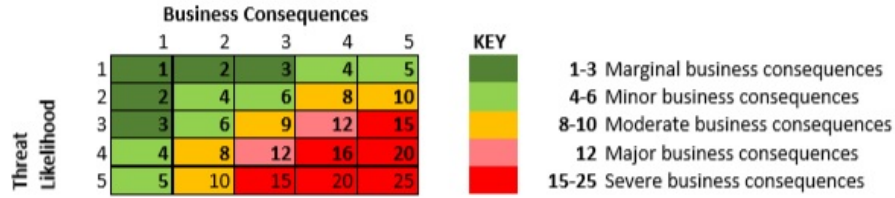
Fig. 4. Proposed 5x5 scoring matrix around an SME’s technical risk and threat vulnerability.