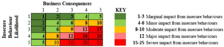
Fig. 2. Phase 1 of behavioural scoring matrix around an SME’s security posture.