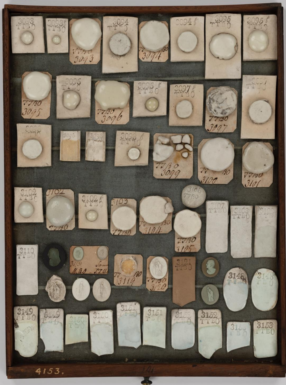
One of Josiah Wedgwood's trail trays curated from the Wedgwood Collection at the V&A.