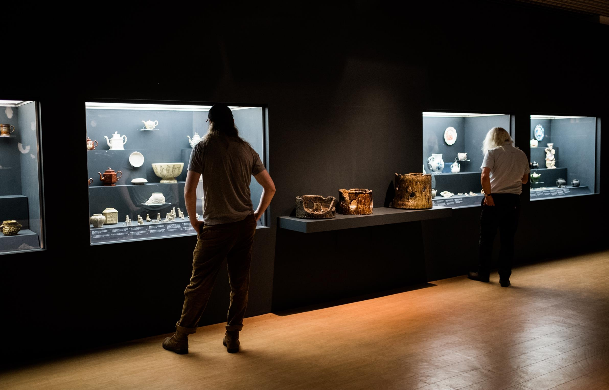
Historic context curated from the collections of PMAG, Wedgwood Collection at the V&A, Spode Museum Trust and Brampton Museum.