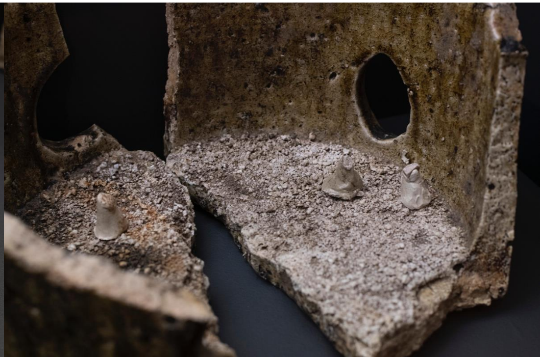
Historic technologies in the production of 18 th century ceramics curated from the collections of PMAG,.