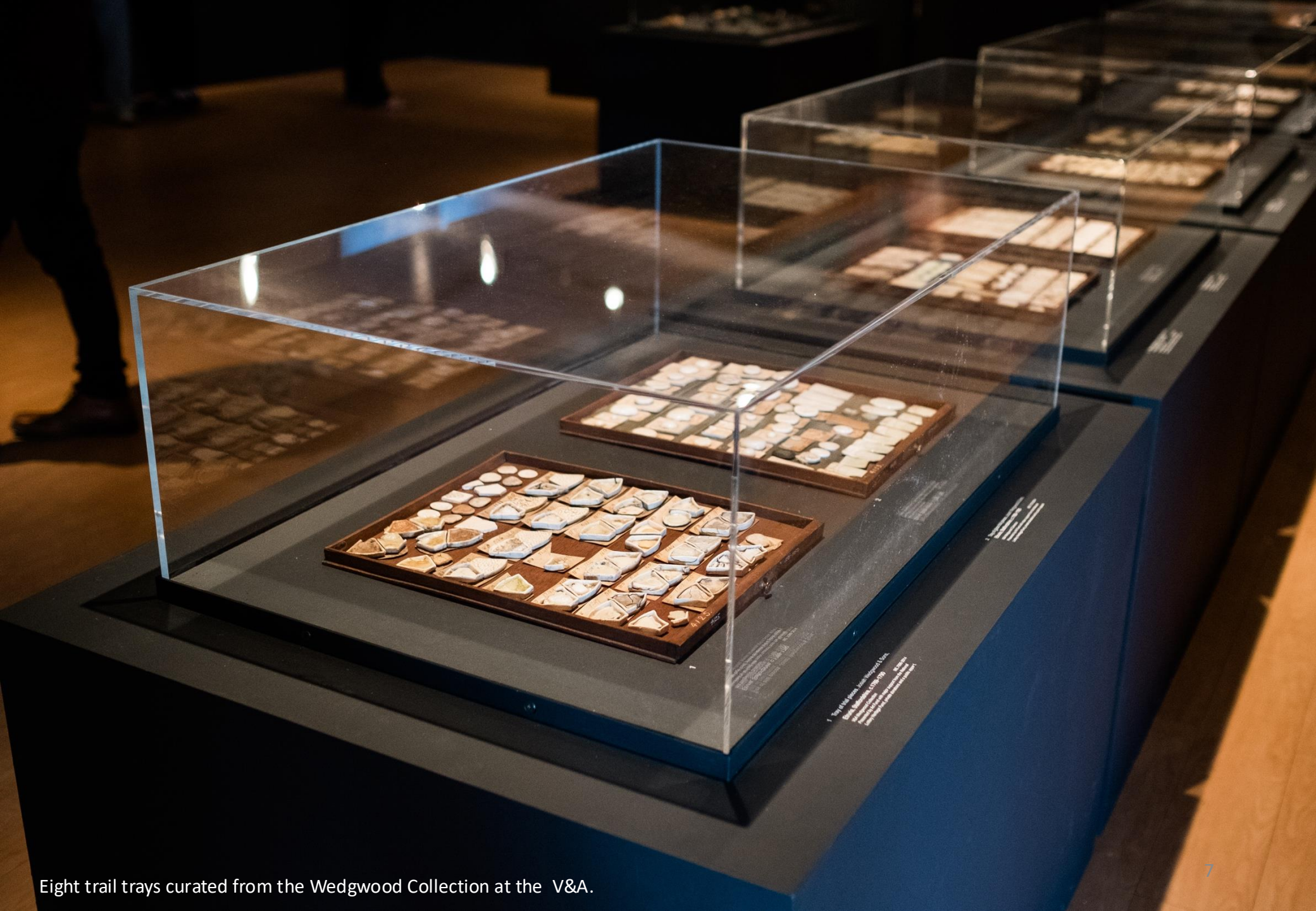
Eight trail trays curated from the Wedgwood Collection at the V&A.