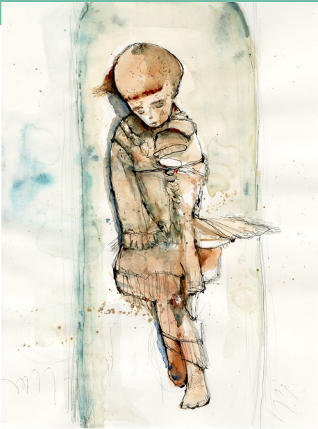
Above: Individual B035 was between 2½-4½ years old at the time of death. This person had pes cavus (foot) deformities and Harris Lines, indicating they experienced at least one stressful episode (e.g. illness, malnutrition) during life. Anthropogenic mummification was used to preserve this non-adult.

The absence of radiological pathologies suggests that short-term or acute diseases (e.g. TB, cholera, or smallpox) were the primary causes of death in the individuals examined.