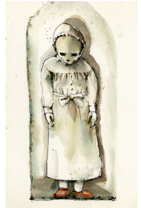
Above: Individual B032 was aged between 7-9 years old at the time of death and is one of the older non-adults in the Children's Room. Spontaneous mummification was granted to this individual.

“Their angels in heaven constantly gaze in God’s face”