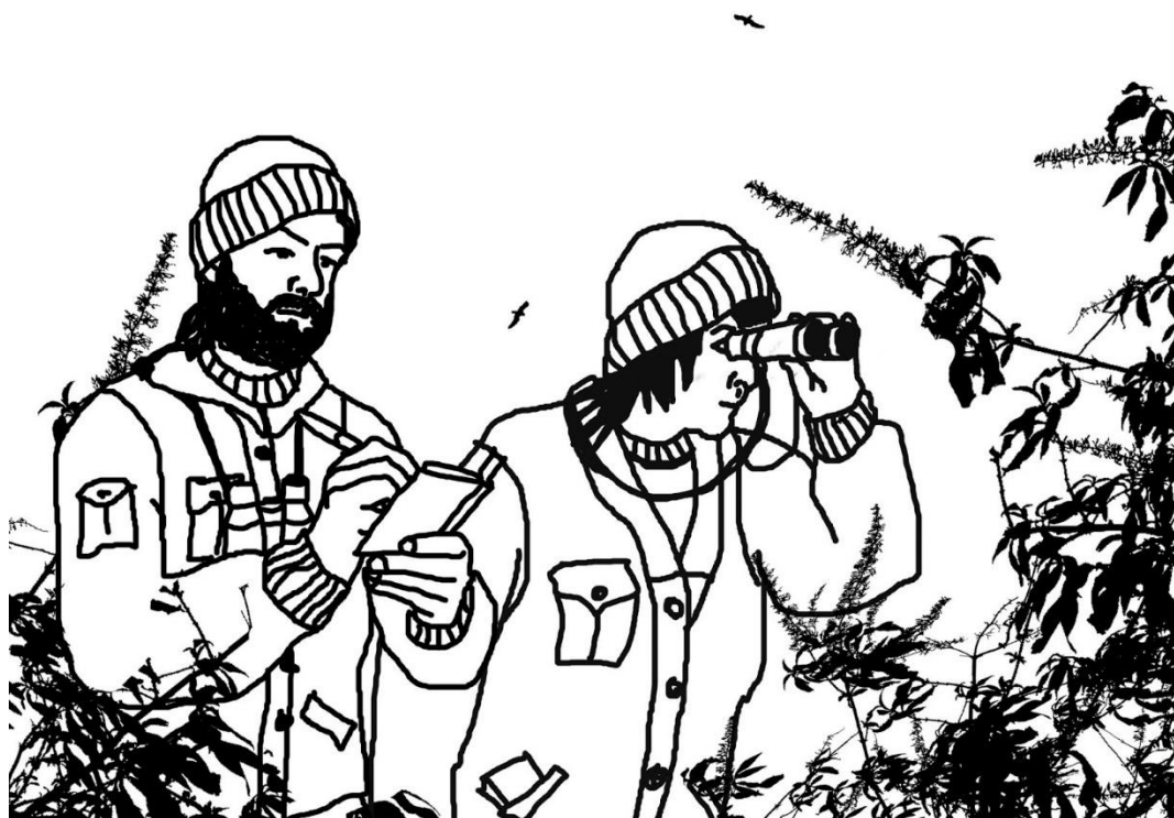
Image: Performance proposal image of Birder's Paradise.

This ambitious season saw total audiences of 1.2 million people and included work by 469 artists with 57 new commissions, 113 performances and 183 workshops.