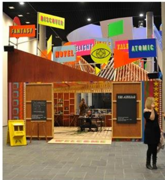
Image: Left - Birder's Paradise Information stand proposal sketch. Right - installed information stand within the Library of Birmingham.

The commission consisted of a series of Perspex bird sculptures, themed to talk about links between birds and books. The sculptures were hidden around the library, and a trail activity created. The commission also included a series of performance workshops related to birds and aimed at creating space to explore the new building.