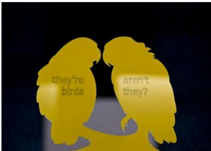
The Love Birds from Daphne Du Maurier's The Birds.

The commission consisted of a series of Perspex bird sculptures, themed to talk about links between birds and books. The sculptures were hidden around the library, and a trail activity created. The commission also included a series of performance workshops related to birds and aimed at creating space to explore the new building.