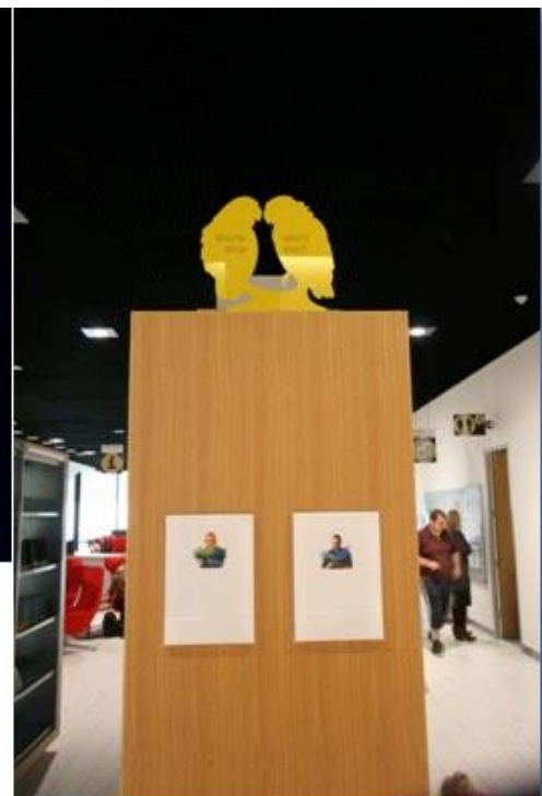
Image: Installed sculpture within the library.