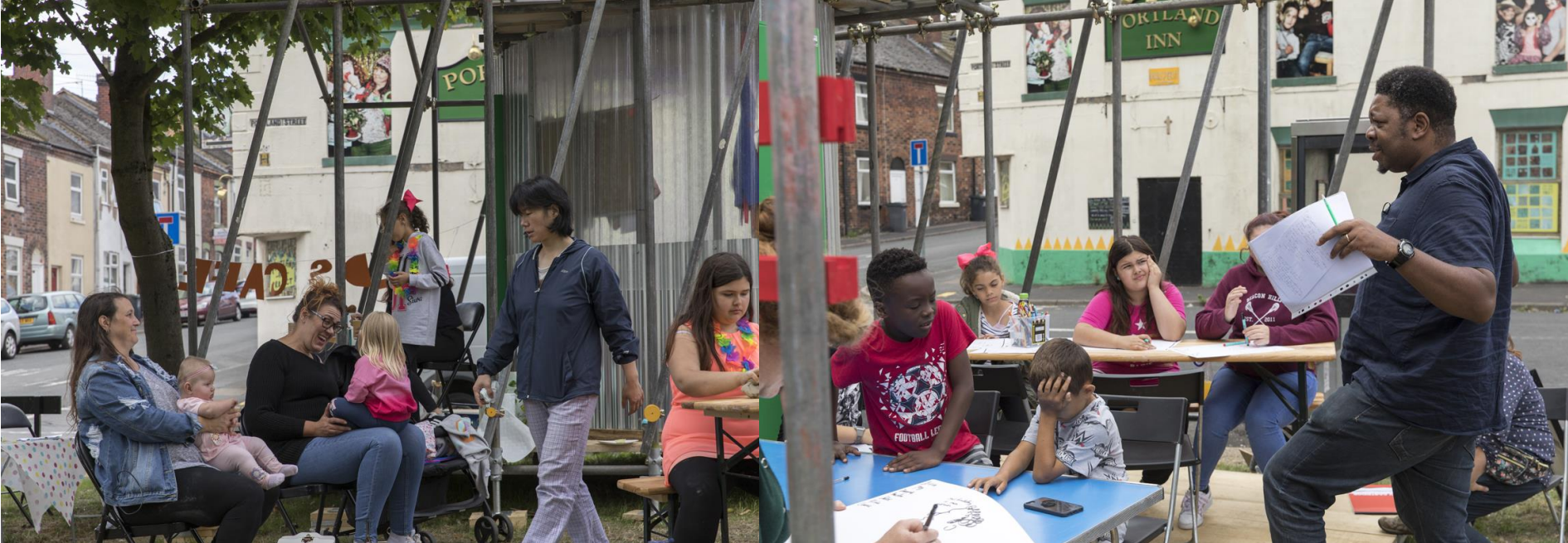
Raising The Roof, 2018: Asset Transfer Agreed and a process to continue to build confidence in the Community around what we can achieve together – Community Co-Build tested