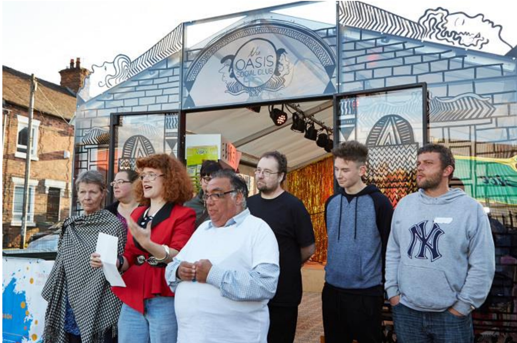
The Oasis Social Club Committee, 2015