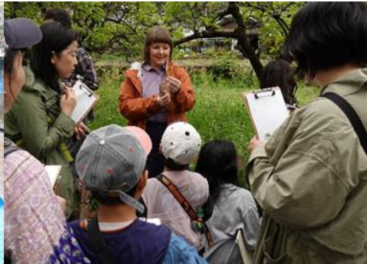
Portland Palissy in Hiroshima, April 2024, and shared at festivals, communities and conferences nationwide