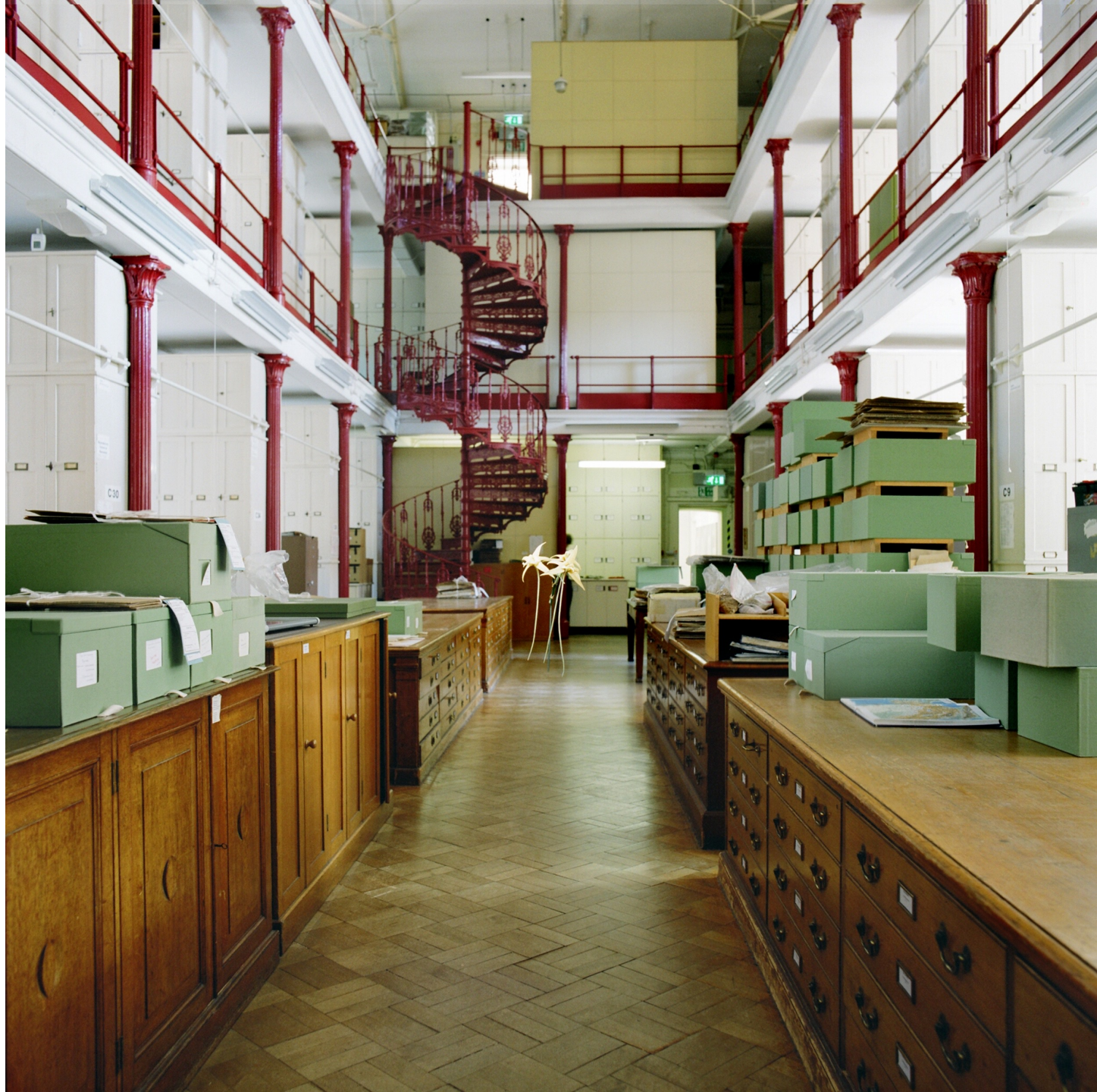
Ian Brown Angraecum sesquipedale (2025) Photograph