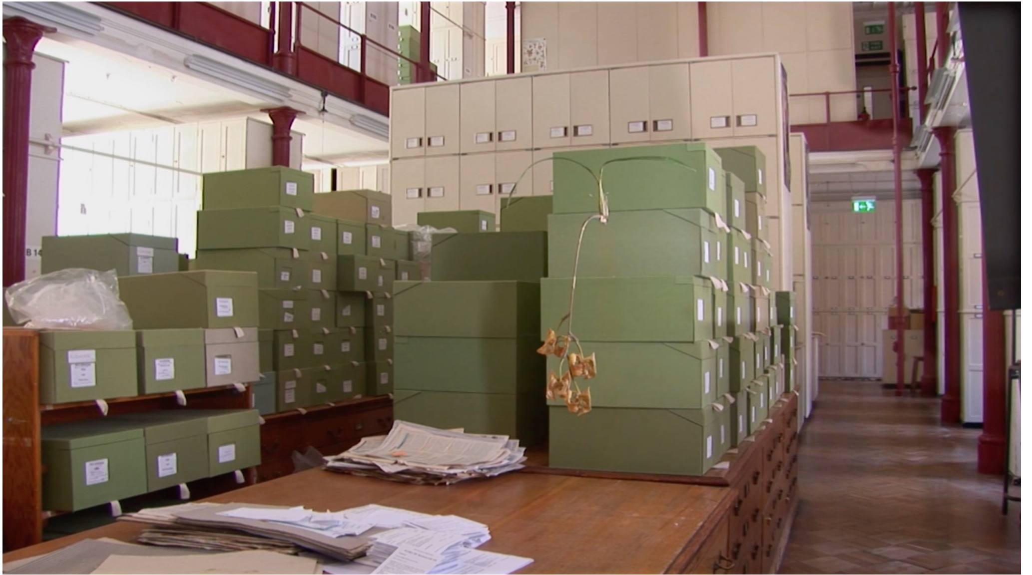
Ian Brown The Longest Living (2025) Single channel video with sound