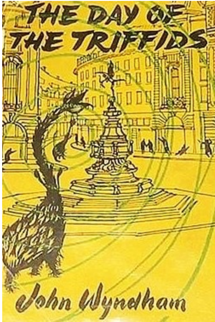
The Day of the Triffids (1951) John Wyndham