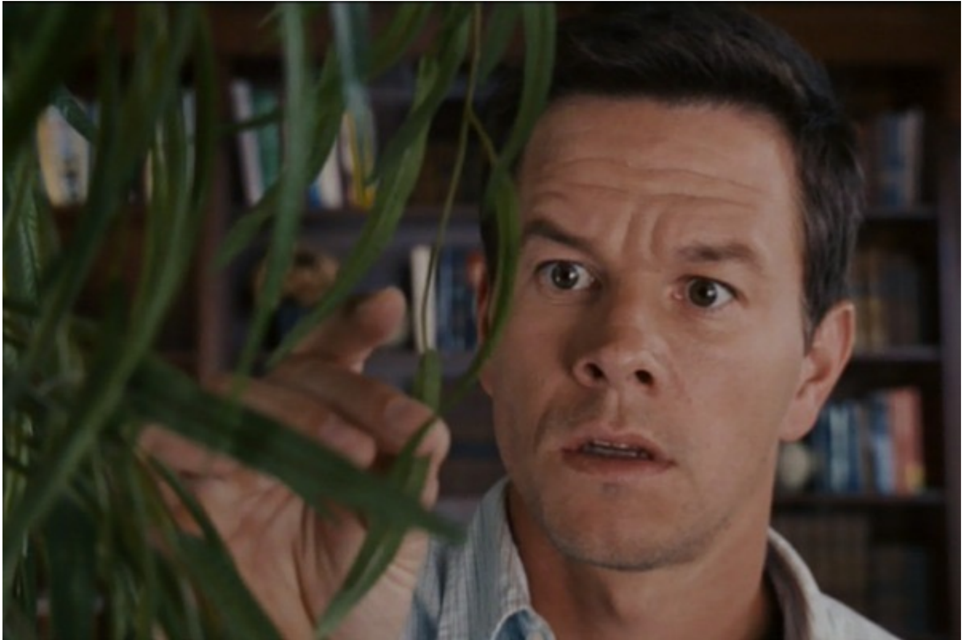
The Happening (2008) M. Night Shyamalan