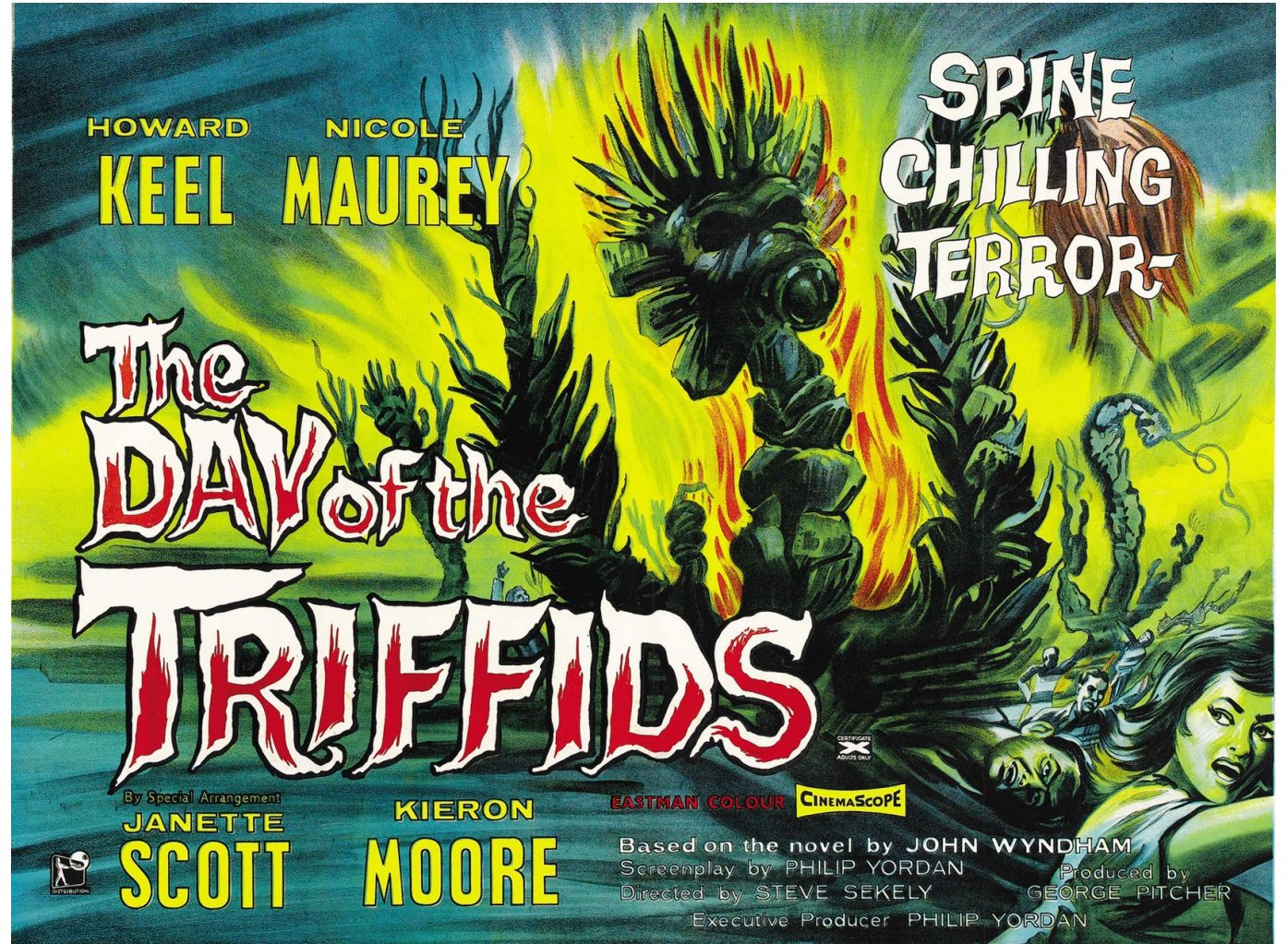
The Day of the Triffids (1963) Directed by Steve Sekely and Freddie Francis