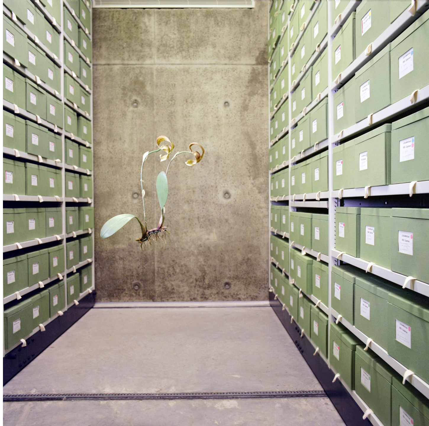
Ian Brown Bulbophyllum grandiflorum 1 (2025) Photograph